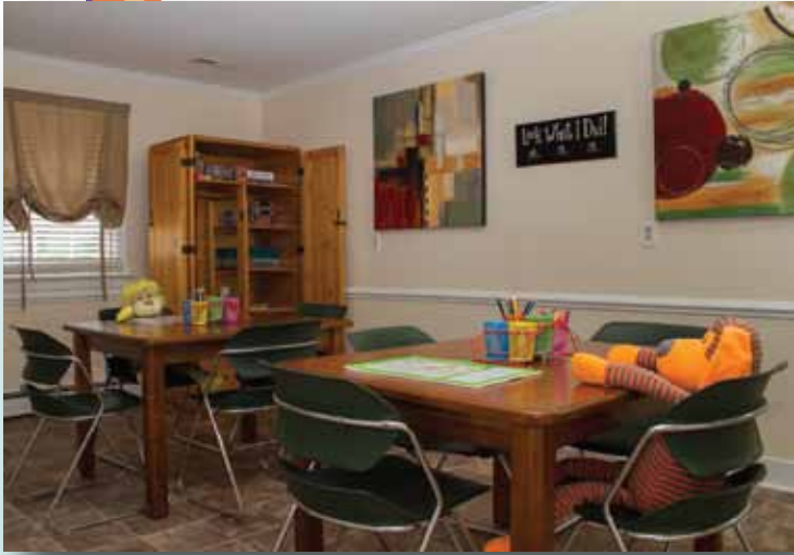
Craft and game area