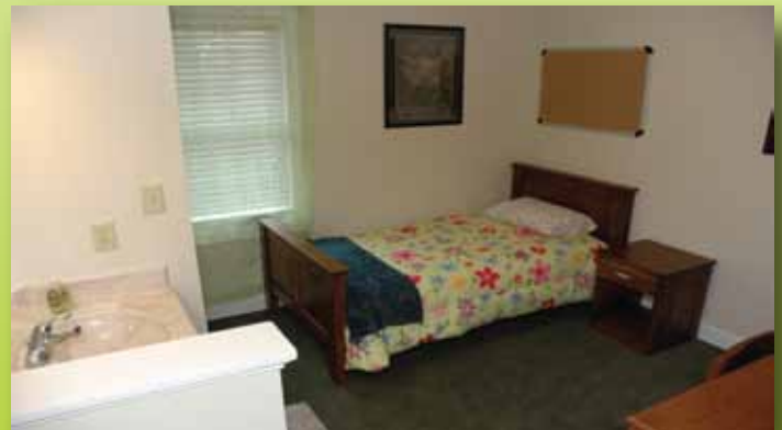
Youth benefit from single bedroom privacy