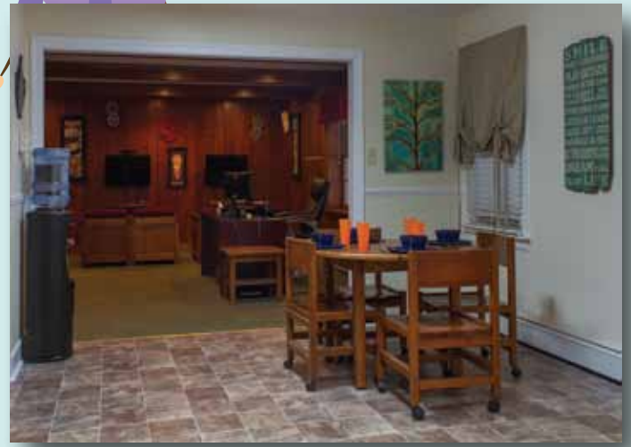
Kitchen and living room