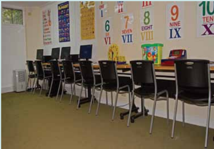
Work stations in the classroom