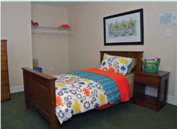
Typical boy's bedroom