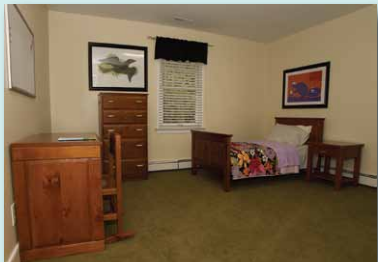
Typical girl's bedroom