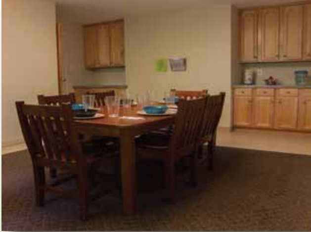
Youth spend time eating together as a “family”