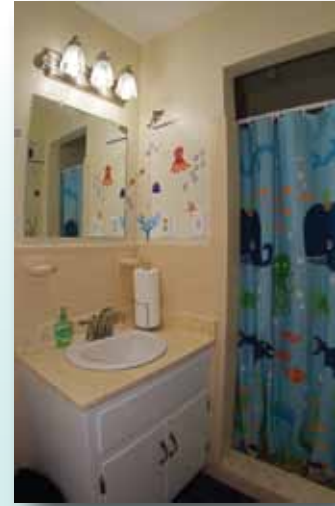
One of three bathrooms